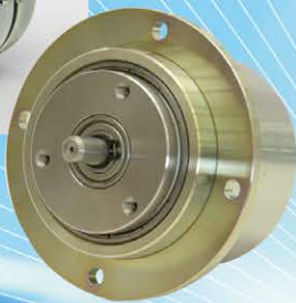
Electromagnetic Particle Brake