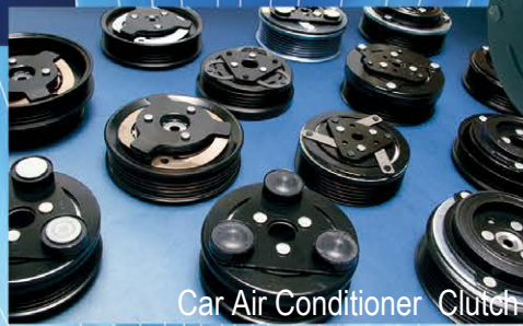
Car Air Conditioner Clutch