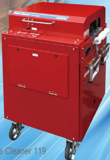
Hose Cleaner 119