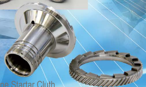
Engine Starter Clutch