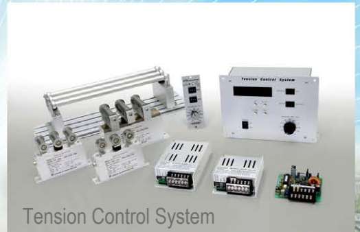
Tension Control System