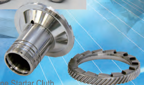
Engine Starter Clutch