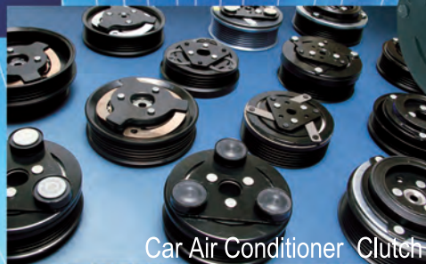
Car Air Conditioner Clutch