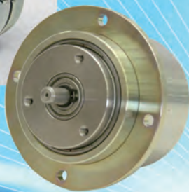
Electromagnetic Particle Brake