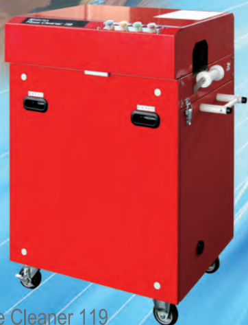
Hose Cleaner 119