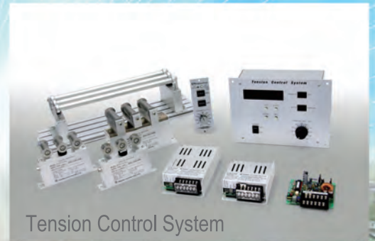
Tension Control System